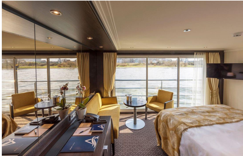
Twin Window Stateroom Included in Cost Panorama Suite Cat A Upgrade $ 3699 per person