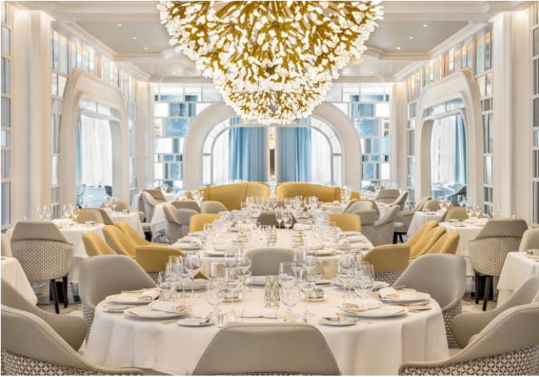
The Grand Dining Room